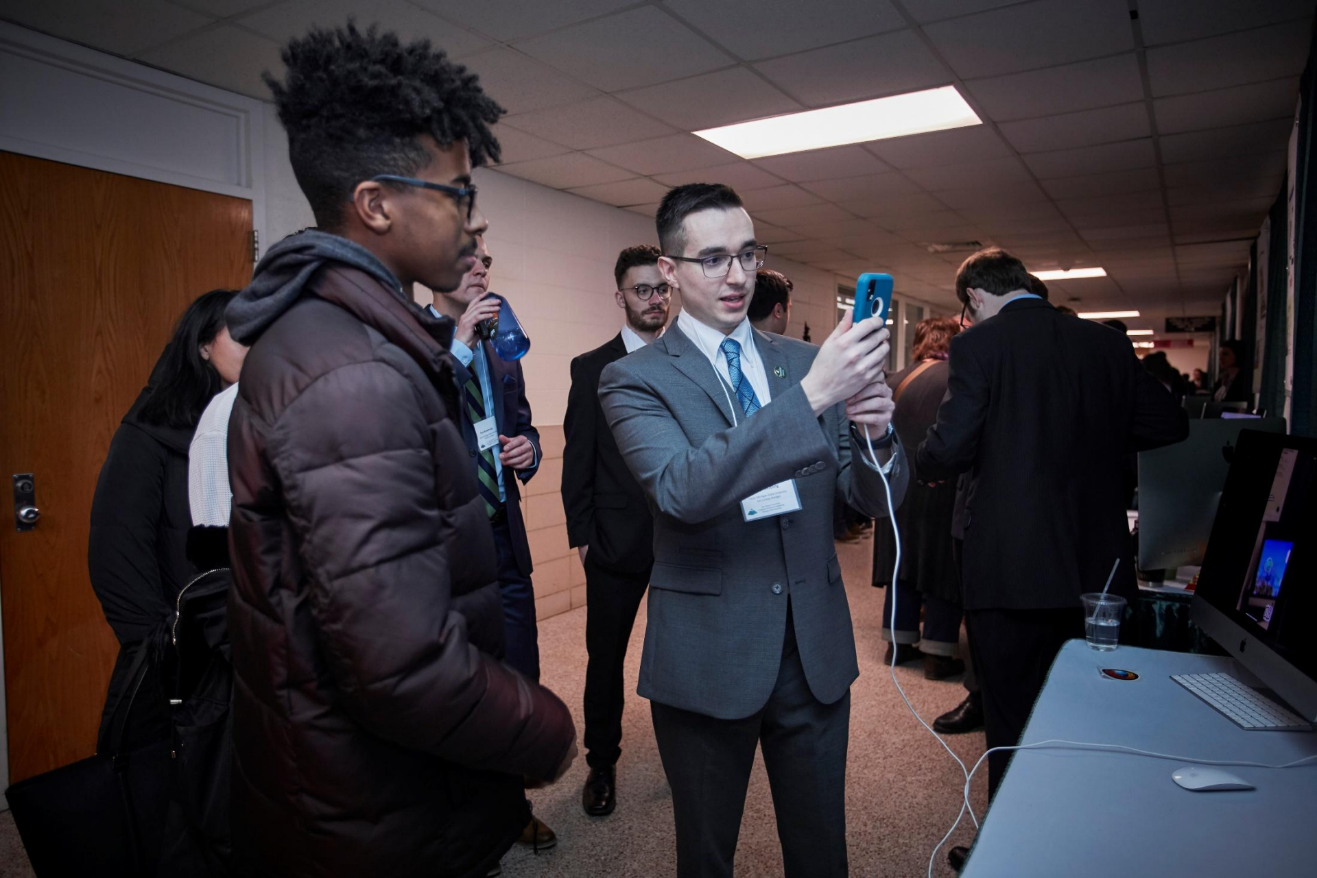
Middle and High School Students