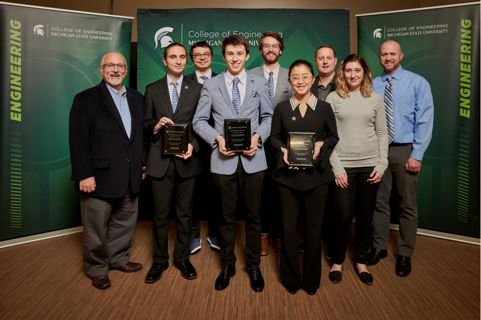
Team Evolutio Wins Urban Science Sigma Award