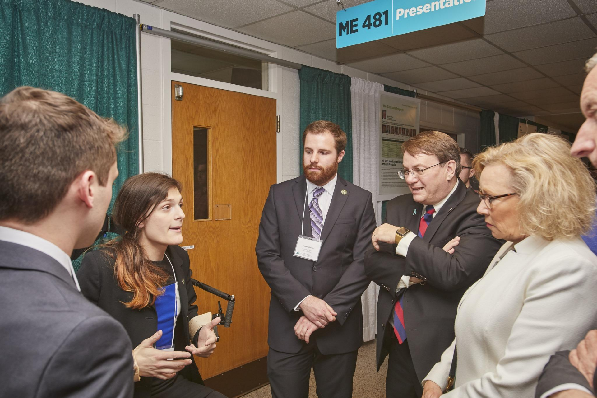
CoE Dean and MSU Board of Trustees Member