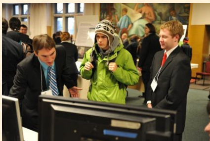
The Capstone Experience Design Day and the Project Video 11