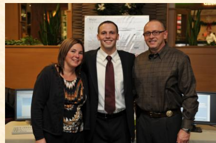
The Capstone Experience Design Day and the Project Video 12