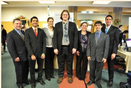
The Capstone Experience Design Day and the Project Video 9