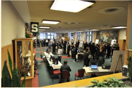
The Capstone Experience Design Day and the Project Video 7