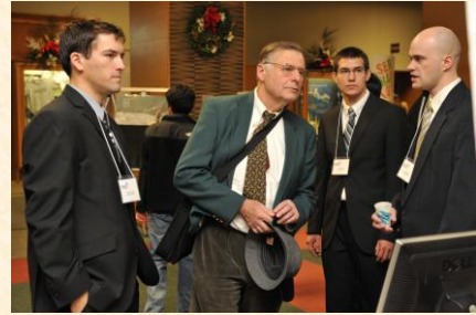
The Capstone Experience Design Day and the Project Video 8