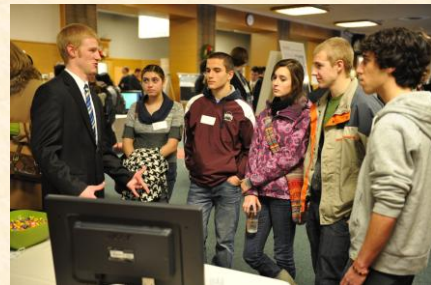
The Capstone Experience Design Day and the Project Video 10