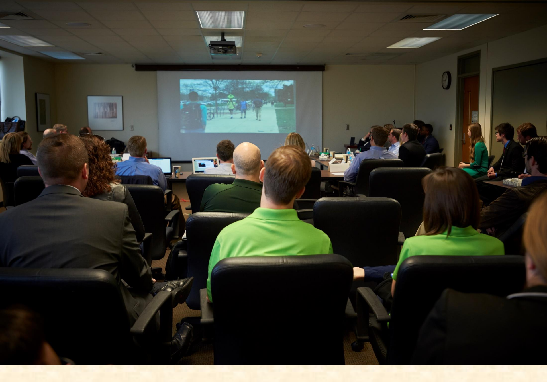
Presenting to Judges