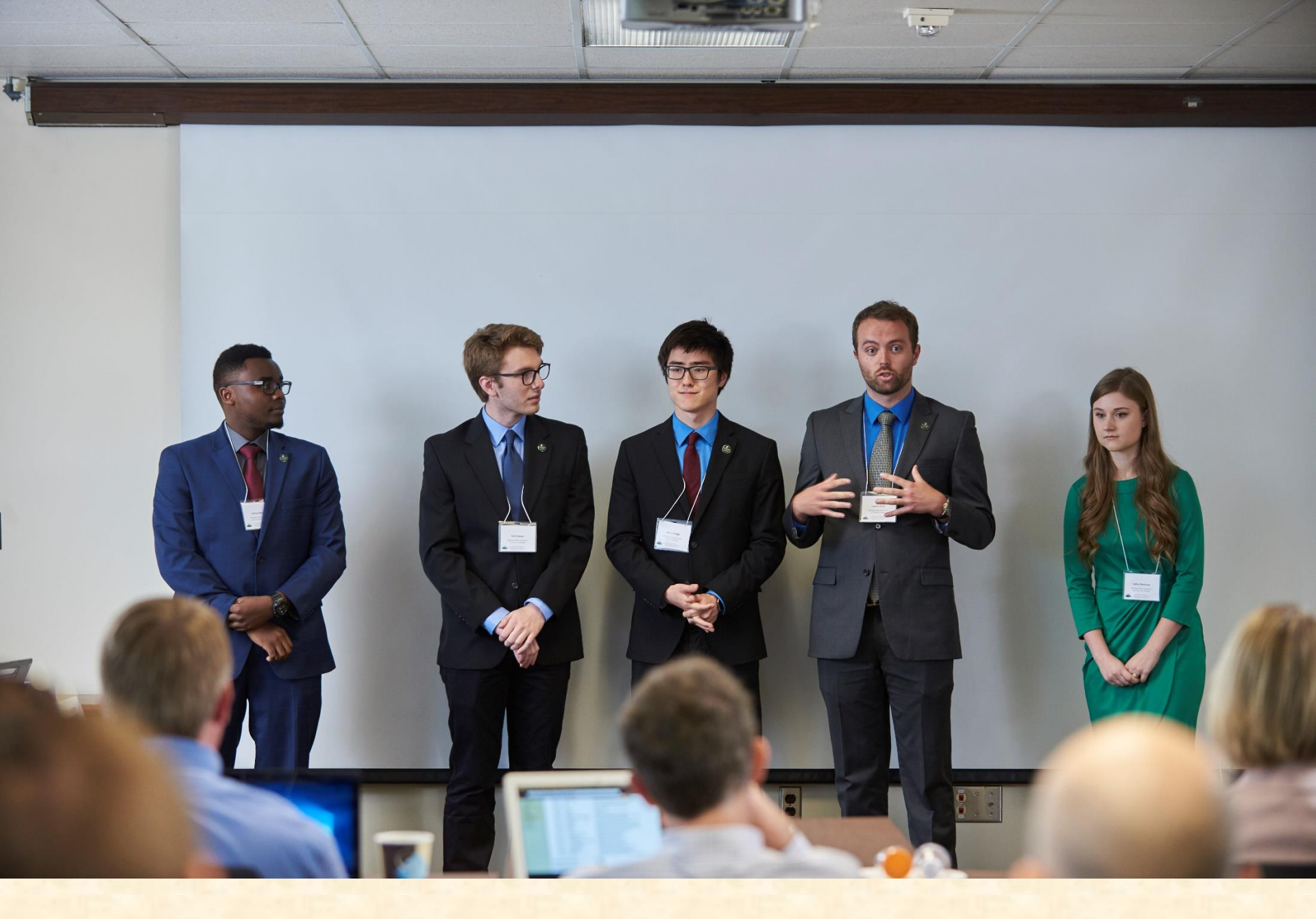
Presenting to Judges