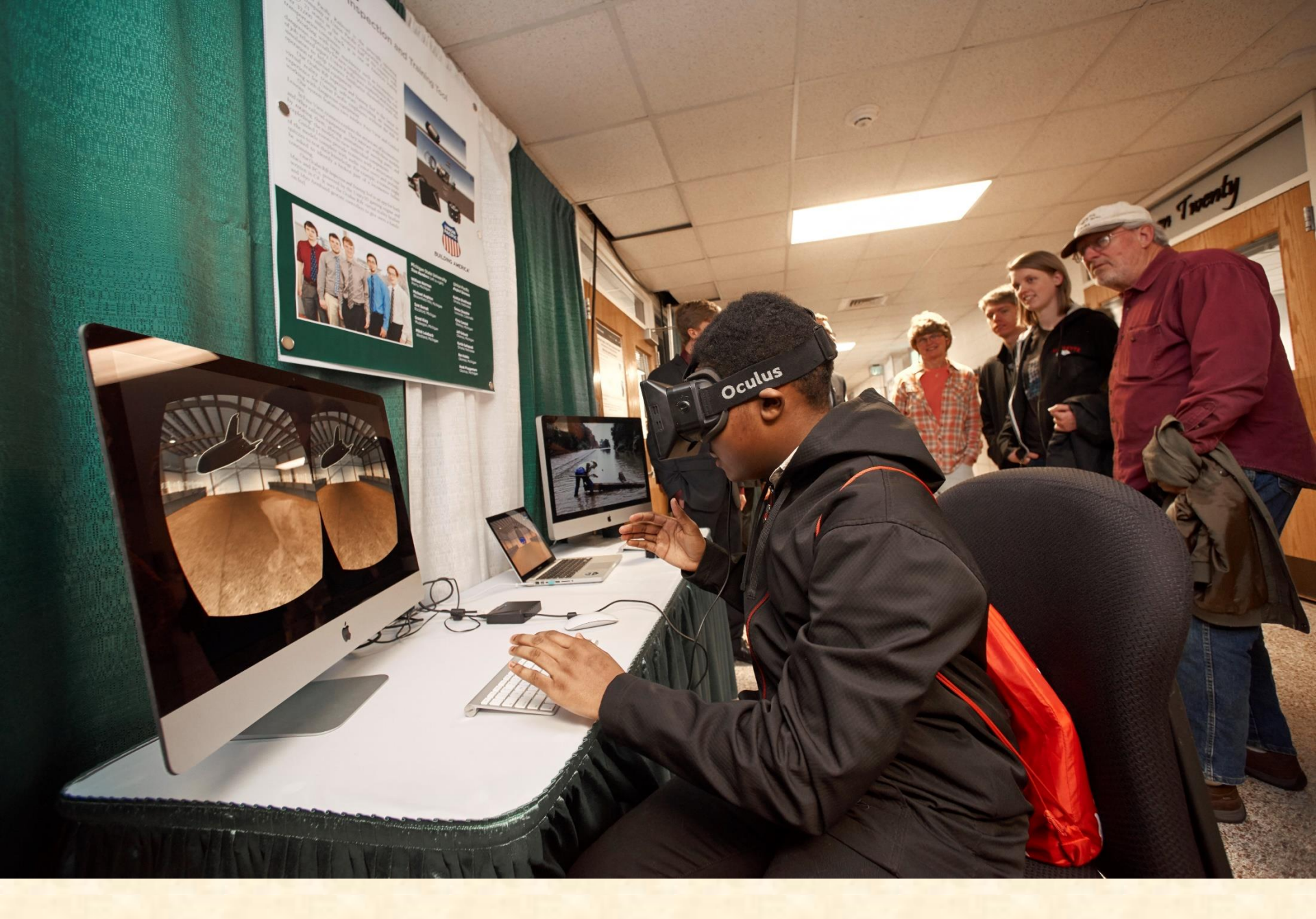
Middle and High School Students